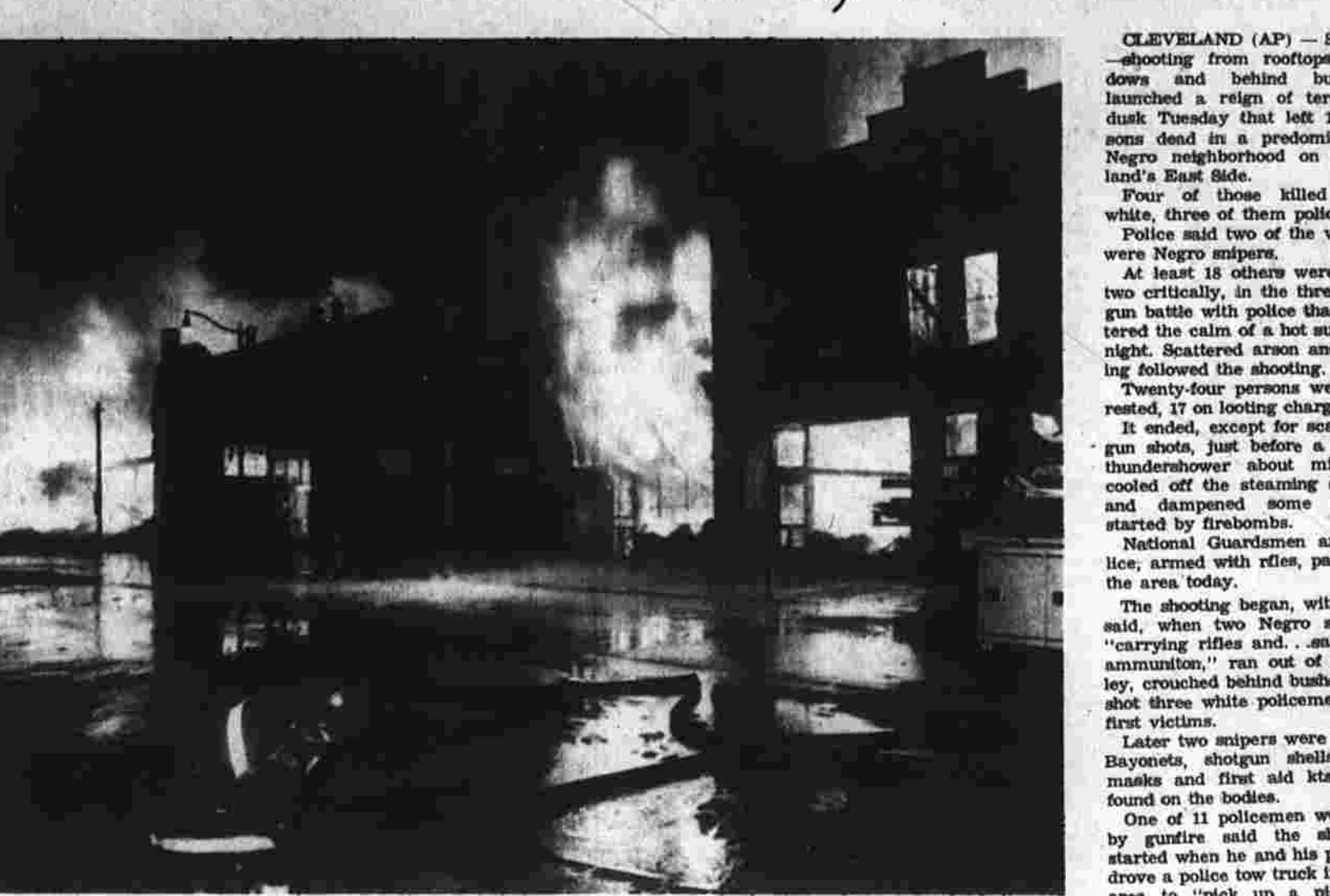
Fire roars out of control Tuesday night in a block of stores on Cleveland's East Side. Some of the stores had been looted and firebombing is suspected. A fireman removed a home line when it became impossible to check the inferno which followed a gun battle between snipers and the police.